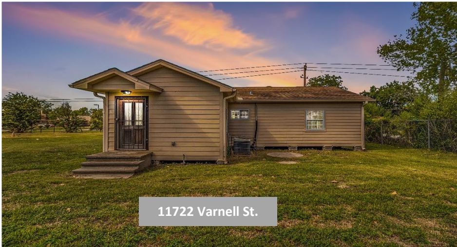
11722 Varnell St.