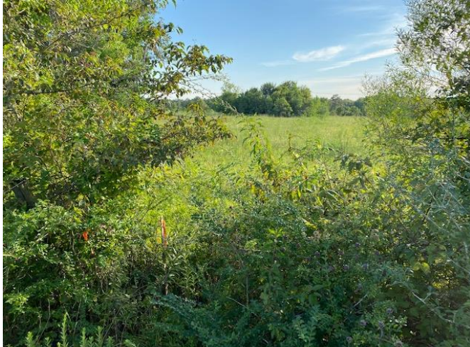
300 linear feet of frontage on SH 3