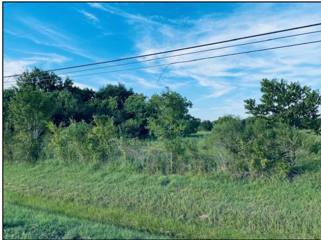
Adjoining the HWY 3 property