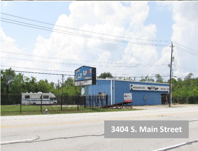
3404 S. Main Street