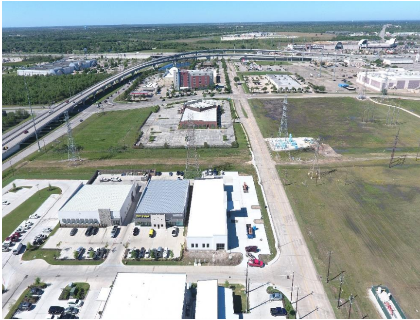
Great Business Park